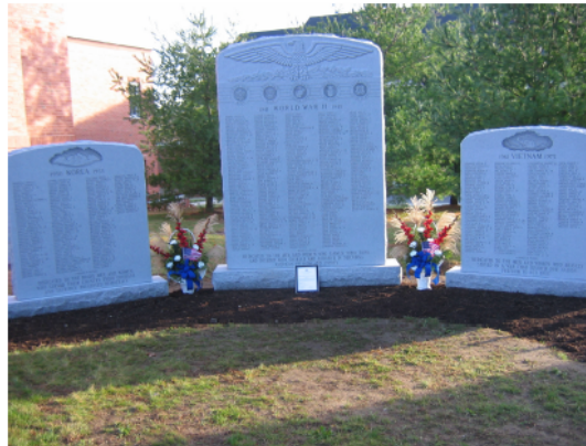
Veterans Memorial on the Lancaster Town Green Dedicated on Veterans Day, November 11, 2006

Enhance the intersection improvement at Lunenburg Road and Old Union Turnpike (rotary project)