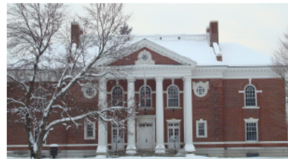
Lancaster Town Hall, built 1908