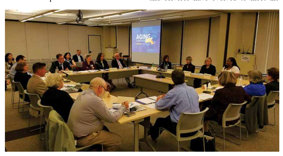
Members of the Governor's Council to Address Aging in Massachusetts meet in Boston in April 2018. The Council, established in April 2017, is the first-ever gubernatorial advisory panel on healthy aging in Massachusetts.

From a planning perspective, city and town leaders routinely make datainformed decisions about how their communities are organized and how services are delivered. During significant demographic shifts throughout our history, schools have been built, zoning laws have changed to accommodate new housing or businesses, and town facilities and services have evolved to meet the