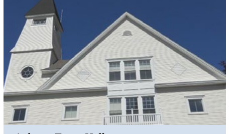
Auburn Town Hall

Like many other Massachusetts communities, Auburn has temporarily closed its town hall (and other town buildings) to the public. Town Hall employees are working from home as much as possible, with minimal in-building staffing for essential functions that can't be done at home. Examples include using software that can't