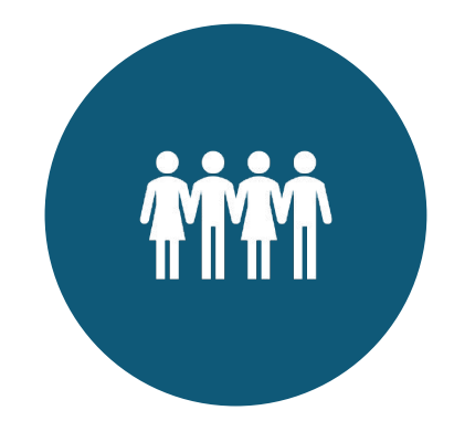
TYPICAL RESPONSE TO TOWN SURVEYS: 200 TO 1,000 RESPONSES