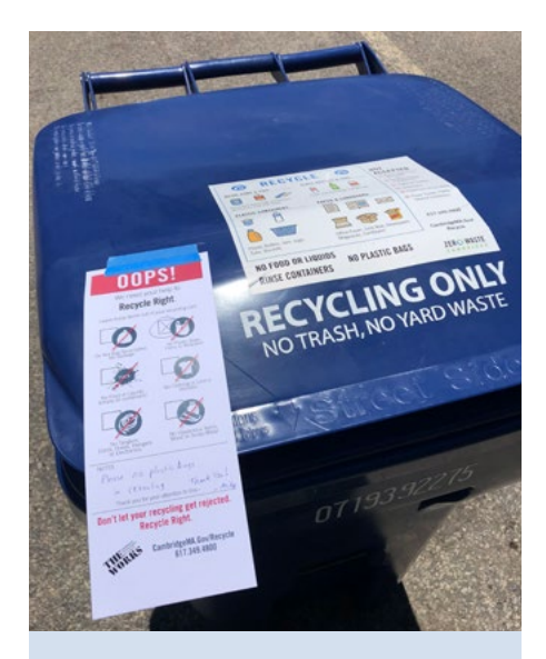
The city of Cambridge has used data analysis and public outreach to reduce recycling costs and improve its program.