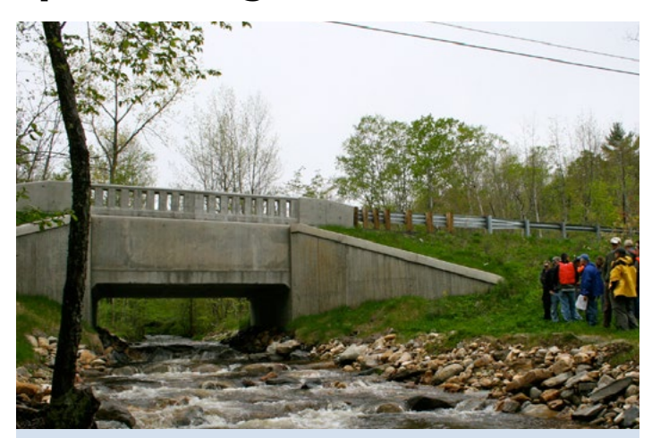
The Division of Ecological Restoration seeks proposals from municipalities looking to replace culverts with assistance from the Culvert Replacement Municipal Assistance Grant Program.

to/culvert-replacement-municipal-assistance-grant-program.