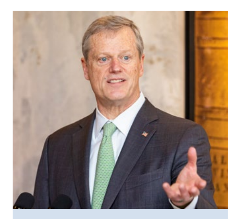
At a Feb. 25 event in Salem, Gov. Charlie Baker announces the move to Step 2 of Phase 3 of the Commonwealth's reopening plan.