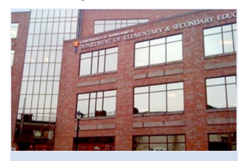
Department of Elementary and Secondary Education headquarters in Malden

allocations per district and details on eligible expenses, can be found on the Department of Elementary and Secondary Education website. The DESE has also posted answers to frequently asked questions about the program.