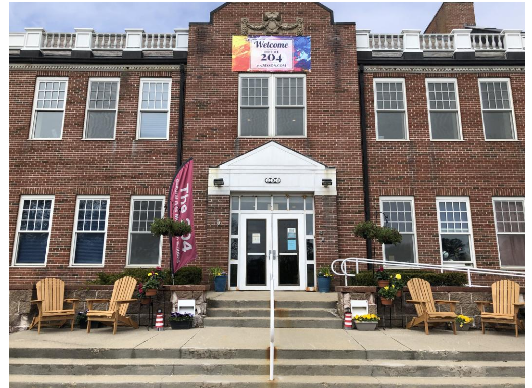
204 Sisson Road, Harwich MA

Interdepartmentally the 204 serves as a place for Recreation Programs, Public Meetings, and other related municipal event and programs.