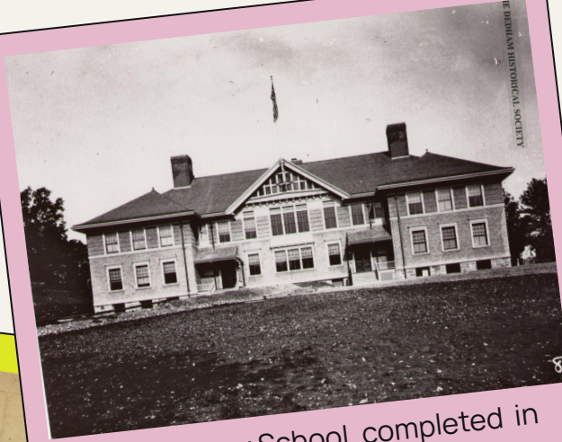
Second Avery School, completed in 1895; destroyed by fire in 1921