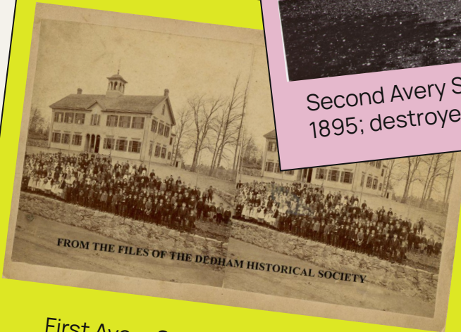
First Avery School, built in 1825