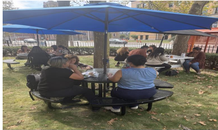
Community Events & Activating New Spaces