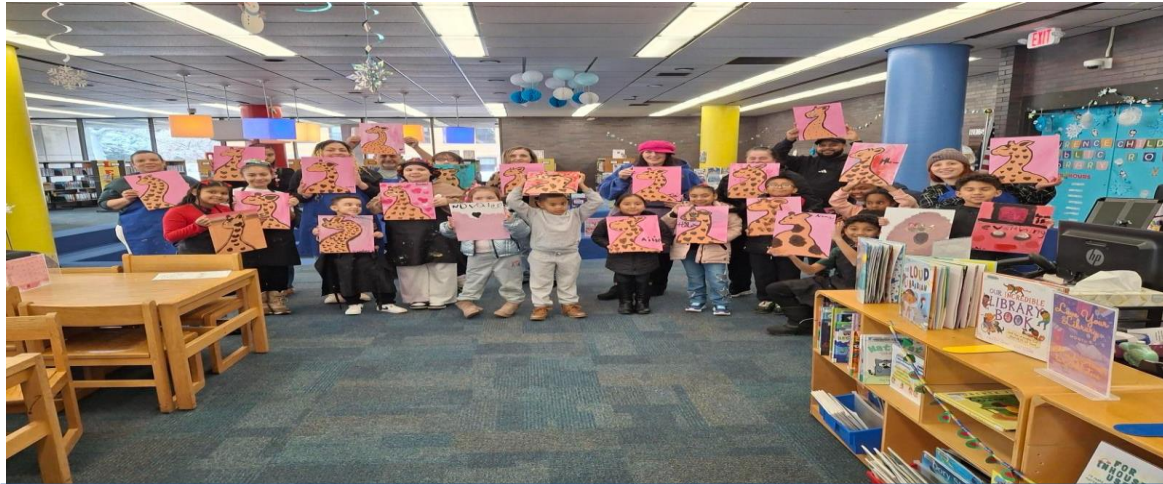
Street Festivals & Community Events