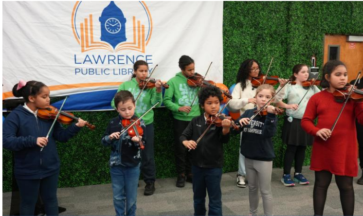
Music & Early Literacy Programs