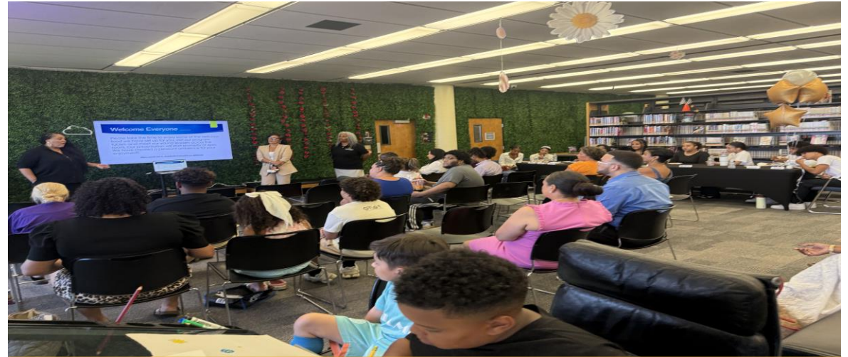
Intergeneration — Library Serves the City