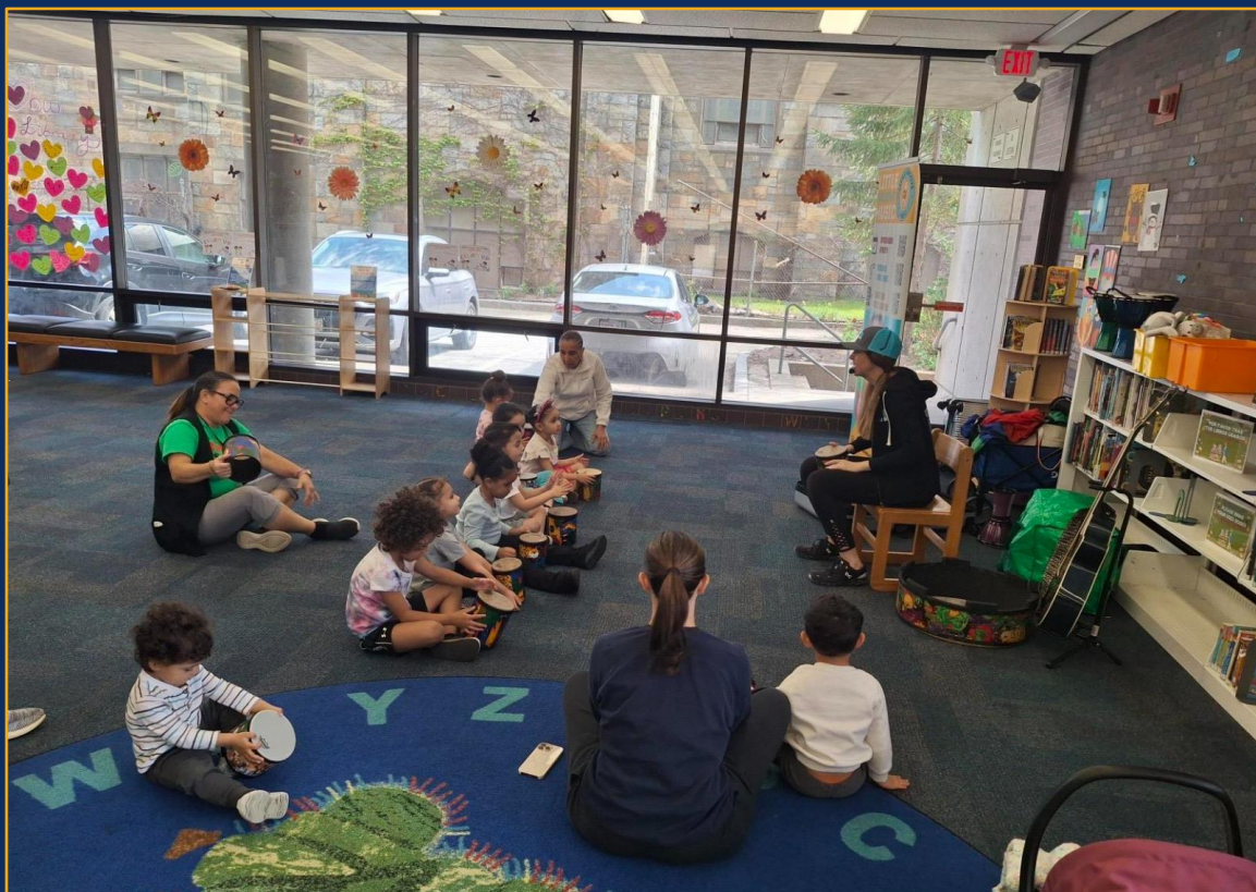
$232,000 MOD ADA Grant — Commonwealth of Massachusetts