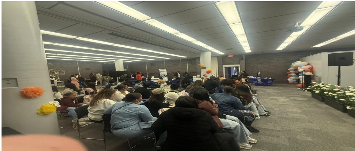
Meeting Rooms: A Community Living Room