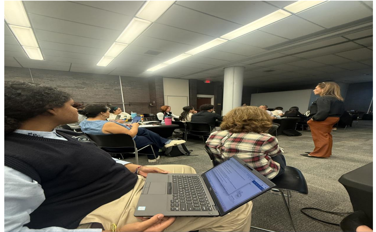
Community Workshops & Collaborative Learning