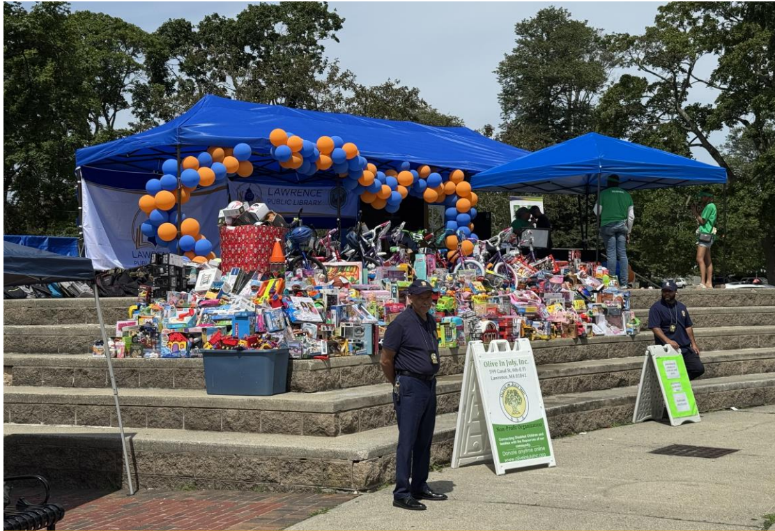
Collaborative Ecosystems and Stewards in Citizenship