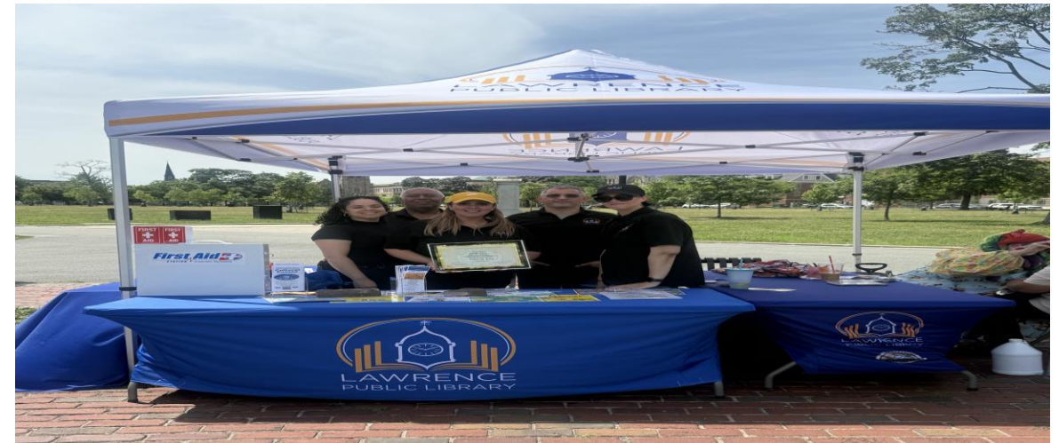
Supply Drive Partnership, Street Festivals & Community Events