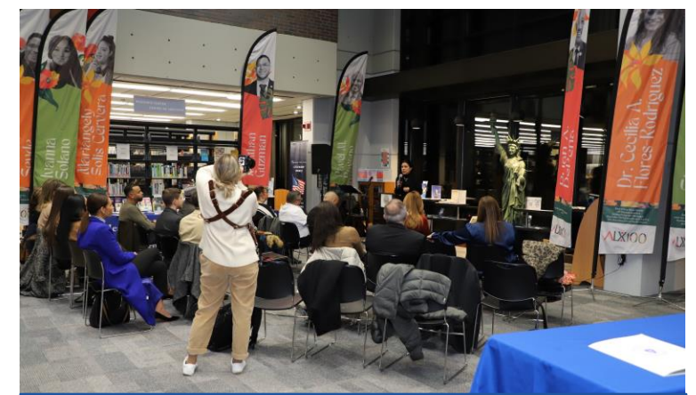
Resource Fairs and Speaker Series